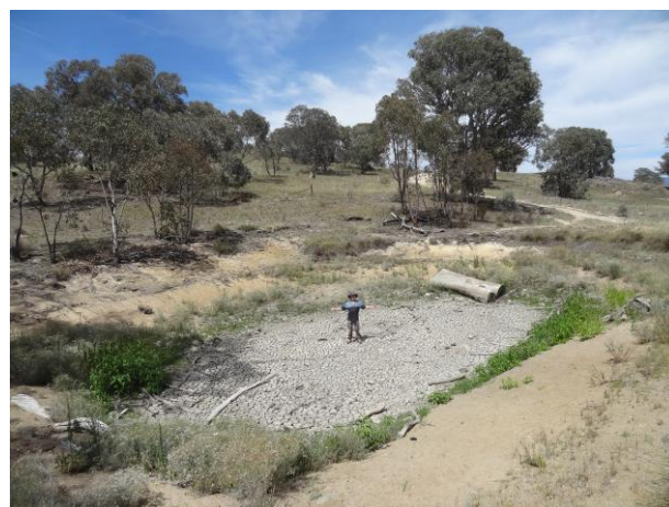
Kathner St Dam 8 Dec 2018