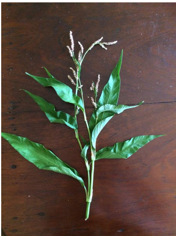
Persicaria lapathifolia