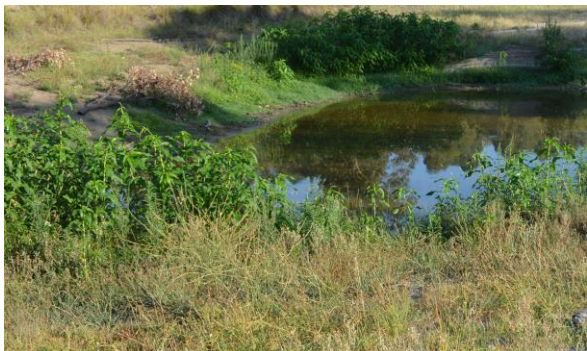
Persicaria lapathifolia at the Old Dam

Also known as Pale Knotweed, Persicaria lapathifolia , has shot up around the Old Dam after recent and welcome rains. It is a herbaceous species of plant in the family Polygonaceae , with a self-supporting growth habit. It is a photoautotroph .