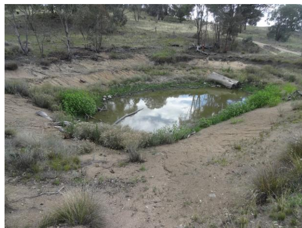
Kathner St Dam 16 Dec 2018